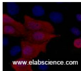
Immunofluorescence analysis of 293 cells transfected with a His tag protein tissue using His-Tag Monoclonal Antibody at dilution of 1:1000.